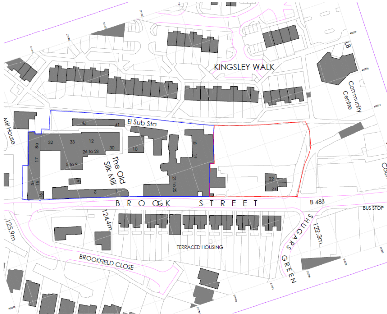
Site Location Plan 1:1250

OLD SILK MILL, BROOK STREET, TRING, HP23 5EF